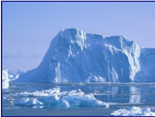
Ices of Antarctica - the easiest water on the Earth - 90 ppm

Essentially the maintenance of heavy water on 10-12 % is more useful some water which we usually drink - thawed snow of high-mountainous glaciers, in it more low. Not casually among mountaineers who drink it regular, it is much more long-livers, than among inhabitants of the big cities.