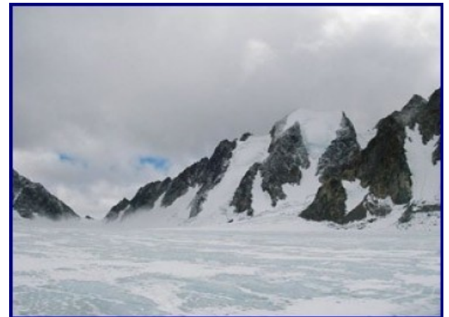
Thawed snow and snow of high-mountainous glaciers (6000-7000) - 128-132 ppm