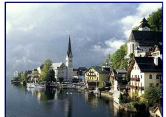
Central European water - 149-150 ppm