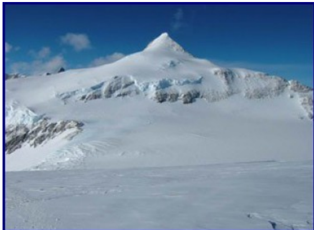
Ice of Greenland - 125 ppm