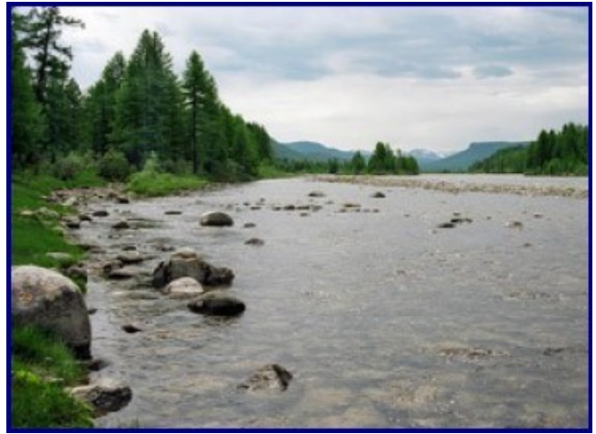
Natural light water in depths of bowels, in springs, wells or wood lakes - is not present

The maintenance deuterium in various natural waters changes from 90 ppm (water from Antarctic ice - the easiest natural water) to 180 ppm - waters in gas layers and closed in layers of Sahara.