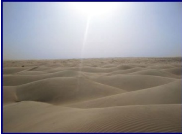
Internal deserts Saharas of water - the heaviest - 180 ppm

• ppm - a unit of measure of "ease" of water - quantity of particles deuterium on 1 million particles.