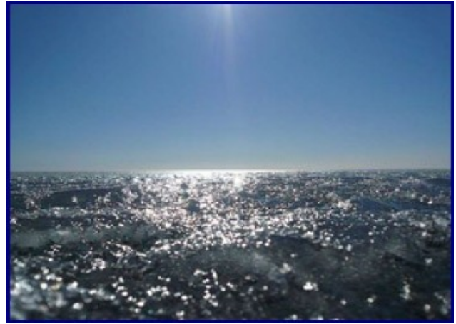
The sea, ocean - 155.76 ppm (V-SMOW - the Viennese standard of ocean water)