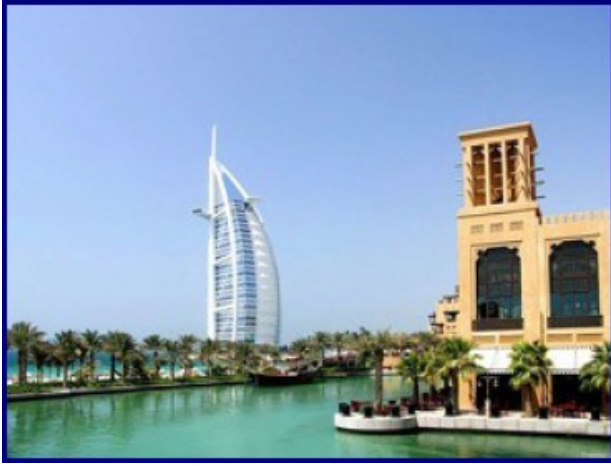
Arab Emirates - 154 ppm

Essentially the maintenance of heavy water on 10-12 % is more useful some water which we usually drink - thawed snow of high-mountainous glaciers, in it more low. Not casually among mountaineers who drink it regular, it is much more long-livers, than among inhabitants of the big cities.